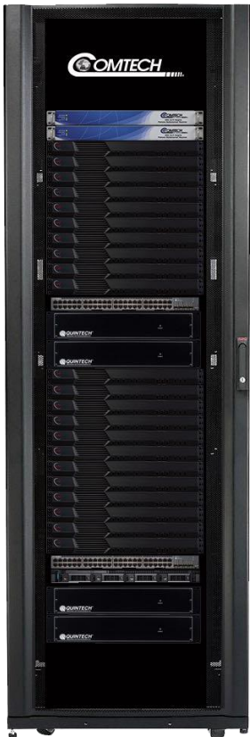
Comtech ELEVATE HUB

Comtech ELEVATE is a scalable, reliable, software- defined solution that brings together the best of Comtech’s popular Heights and MF-TDMA VSAT platforms in a first-of-its-kind leading-edge architecture featuring D-DRAM (Dynamic Return Access Modes) that allows dynamic seamless shifting between MF-TDMA and H-DNA waveforms.