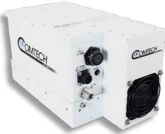
PS 1 Model