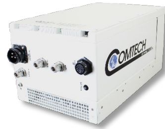
PS 1.5 Model